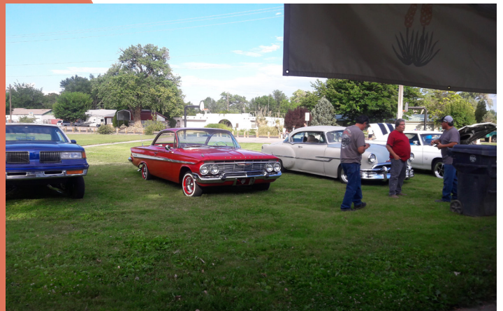
Above: Valley Gardens Neighborhood