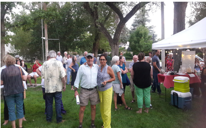
Above: Huning Highland Neighborhood