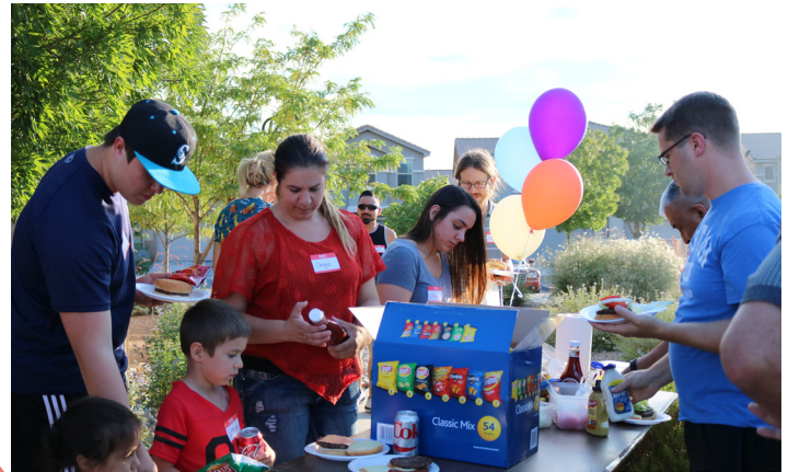
Above: Presidio Homeowners Association