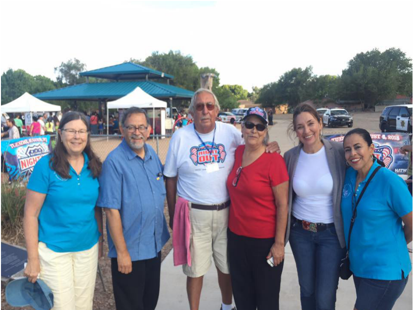
At left: Vecinos del Bosque Neighborhood