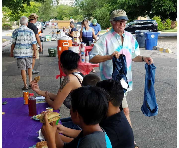
Above: Raynolds Addition Neighborhood