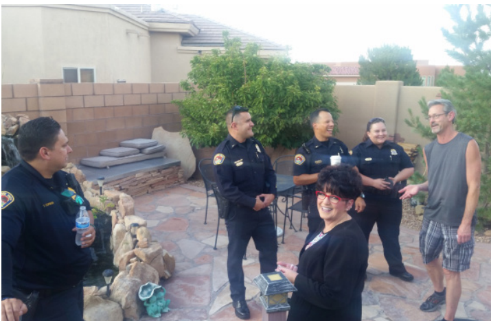
Above: Molten Rock Neighborhood