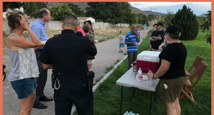
Above: Comanche Foothills Neighborhood