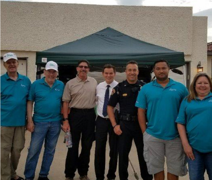
Above: Las Lomitas Neighborhood