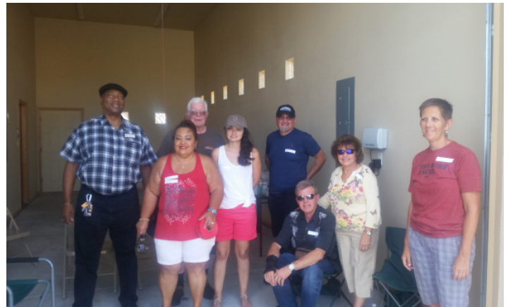
Above: Saltillo Neighborhood