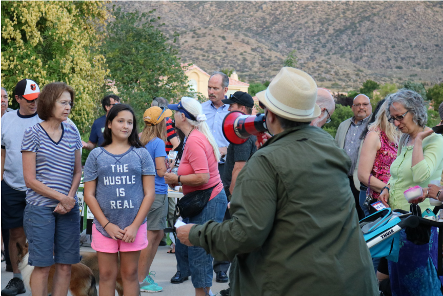
At right: Embudo-Vista Del Mundo-Supper Rock Joint Neighborhood