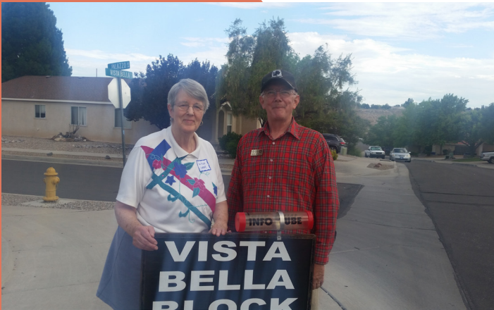
Above: Vista Bella Neighborhood