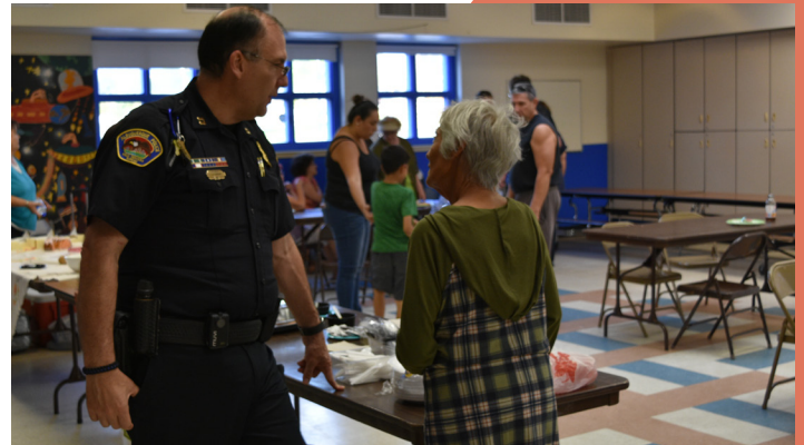
Above: Victory Hills Neighborhood