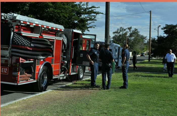
Above: Princess Jeanne Neighborhood