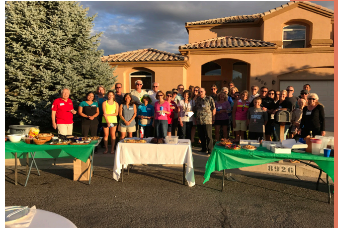
Above: Vineyard Estates Neighborhood