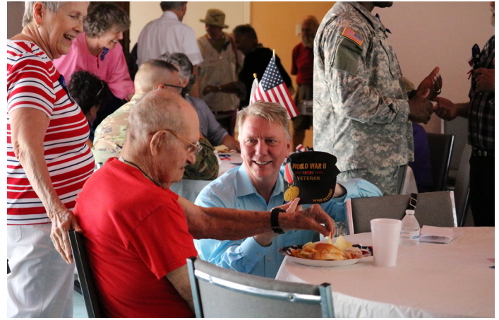
Above: Towne Park Neighborhood