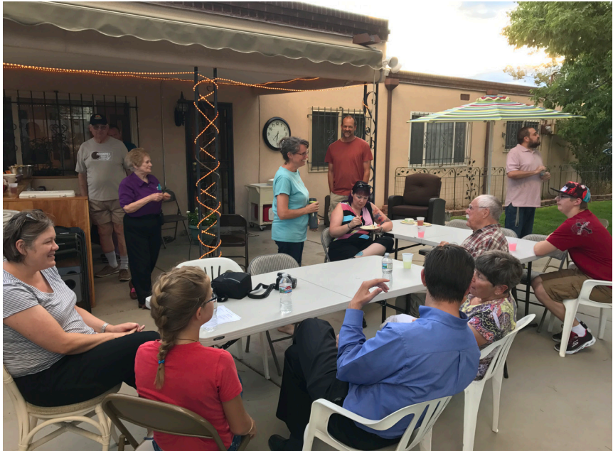
At left: Dona Rowena Neighborhood