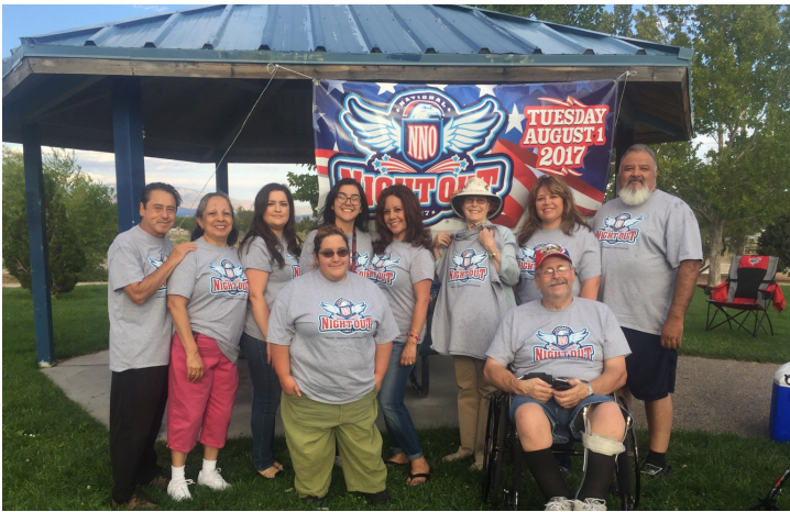
Above: Route 66 West/ Westgate Heights Neighborhoods