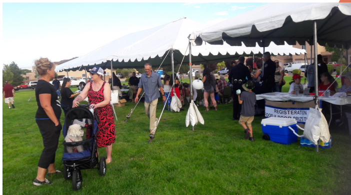
Above: Anderson Hills Neighborhood