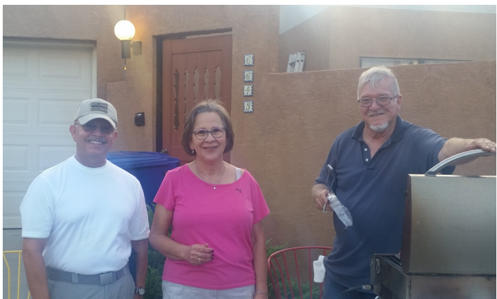
Above: San Blas Neighborhood

includes answers to several Frequently Asked Questions (FAQs) raised by the public, and numerous other project resources.