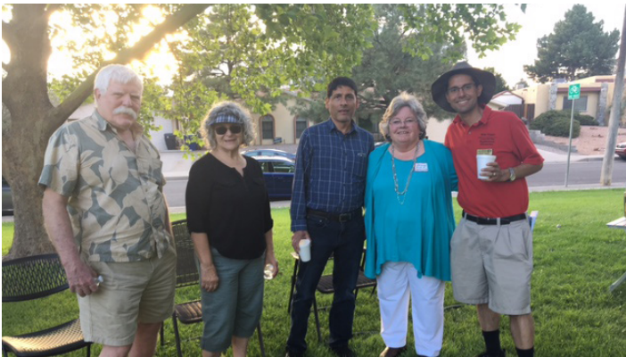
Above: Loma Del Rey Neighborhood