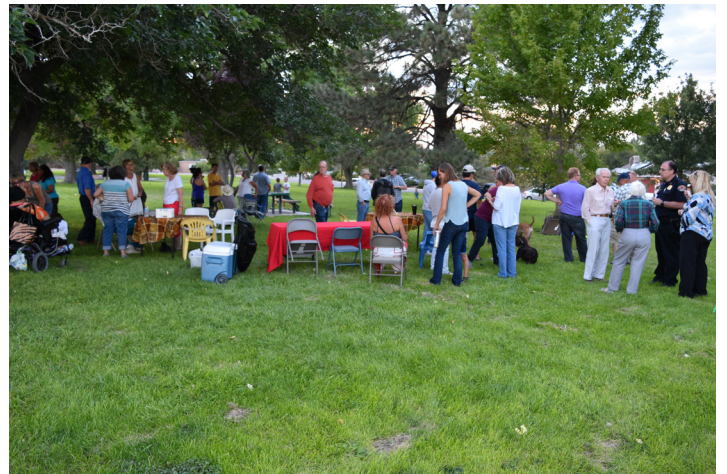
Above: Siesta Hills Neighborhood

The September edition of the Neighborhood News is dedicated to the hard work and efforts of our neighborhoods and residents, and the great job they did for National Night Out on Tuesday, August 1! Scenes from across Albuquerque will be featured throughout this month's newsletter.