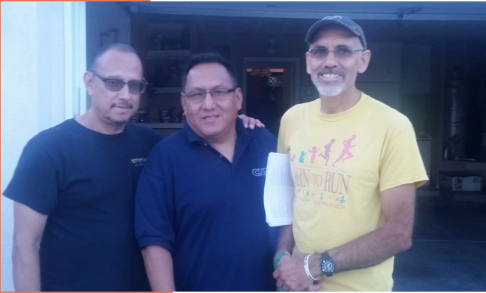
Above: Los Volcanes Neighborhood