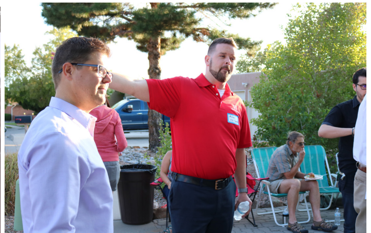
Above: Monte Largo Neighborhood